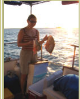
Oh well, two heads...

No hard sales pitch. Times are tough and frills are out for many of us. However, please take some time now and again to check and see what we're up to in our fish infested waters. Thank you for visiting, and good luck to us all!