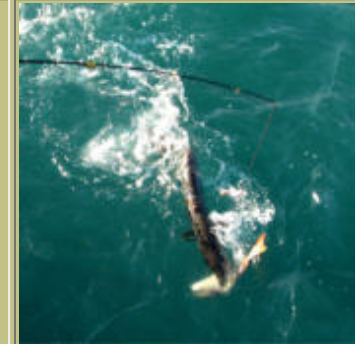
So does he!