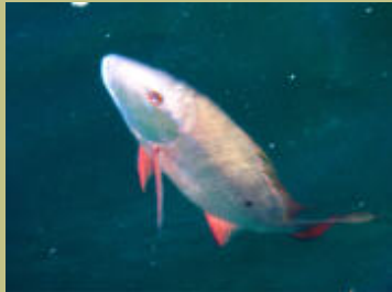
A beautiful snapper