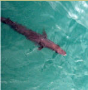
Our 5' barracuda